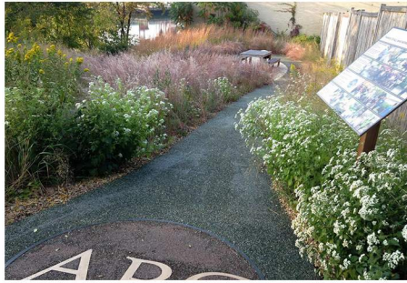
WATERWASH ABC, Lillian Ball 2009-13, Wetland/Grassland Entrance, Recycled Glass Pavement/ Brass, Native plants, Filmstrip signage

TLC under the aegis of the Environmental Protection Agency in contaminated neighborhoods in West Oakland, Calif., and New Orleans.