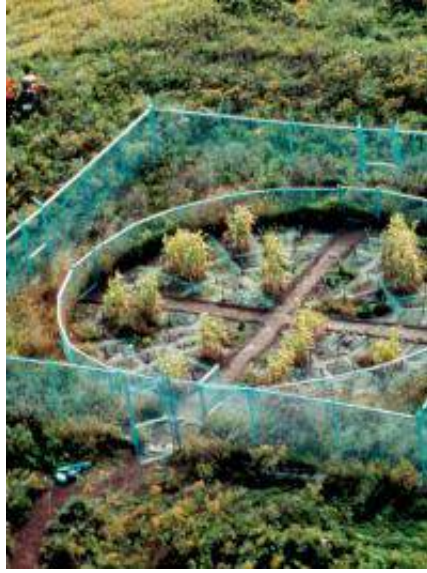
View of Mel Chin's Revival Field at Pig's Eye Landfill near St. Paul, Minn., 1991.