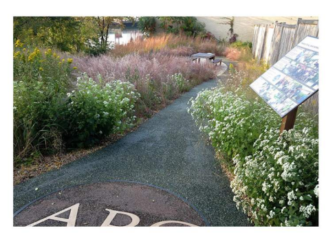
WATERWASH ABC, Lillian Ball 2009-13, Wetland/Grassland Entrance,Recycled Glass Pavement/ Brass, Native plants, Filmstrip signage